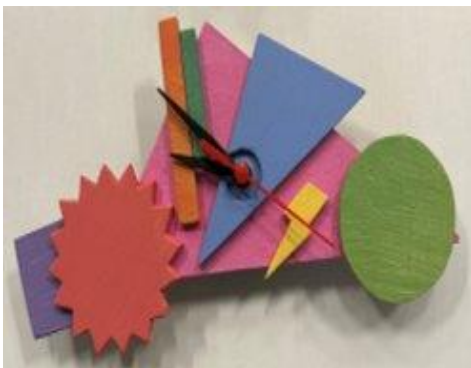
Year 9 – Memphis inspired clock

I would like to share just a few of the amazing pieces of work that year 9 have completed this year. Our students have made the DT team very proud of all their creative ideas and the quality of work they are producing.